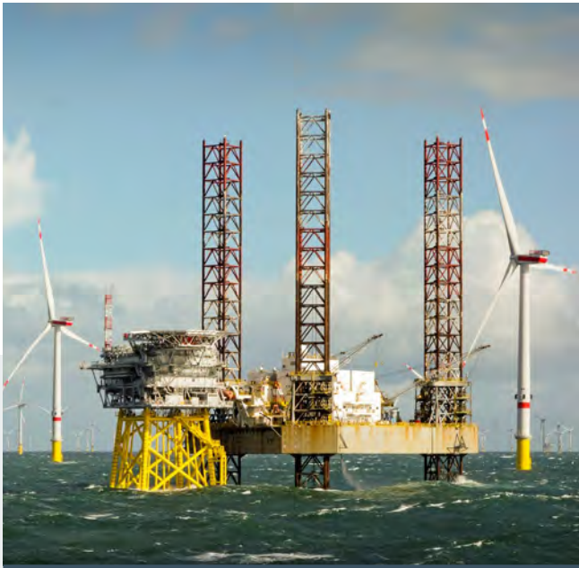
712MW OFFSHORE WINDFARM