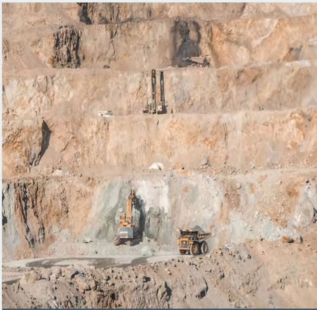
VANADIUM MINE 📍 Australia Client: Project Insurer Services: BI Timeline Analysis