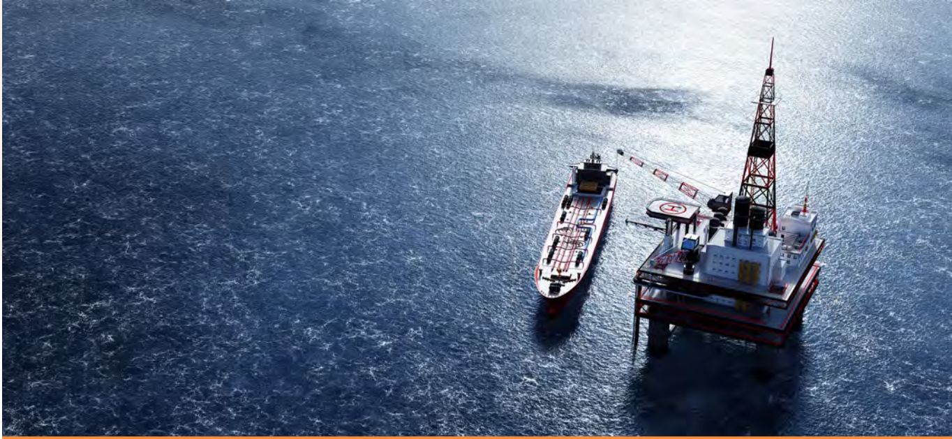
MOPUstor 📍 North Sea Client: Project Insurer Services: Delay Analysis