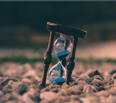
Delay Analysis (DSU) and Timeline Analysis (BI)