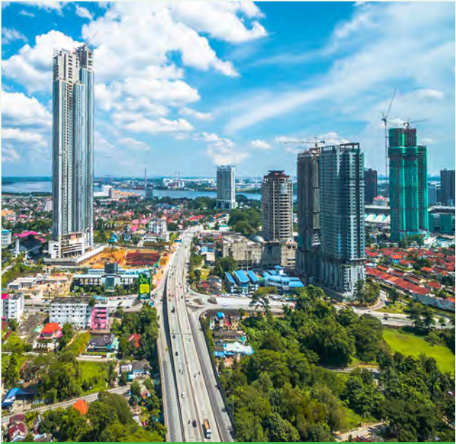
37-STOREY OFFICE TOWER

Client: International EPC Contractor Services: Expert Services (Delay)