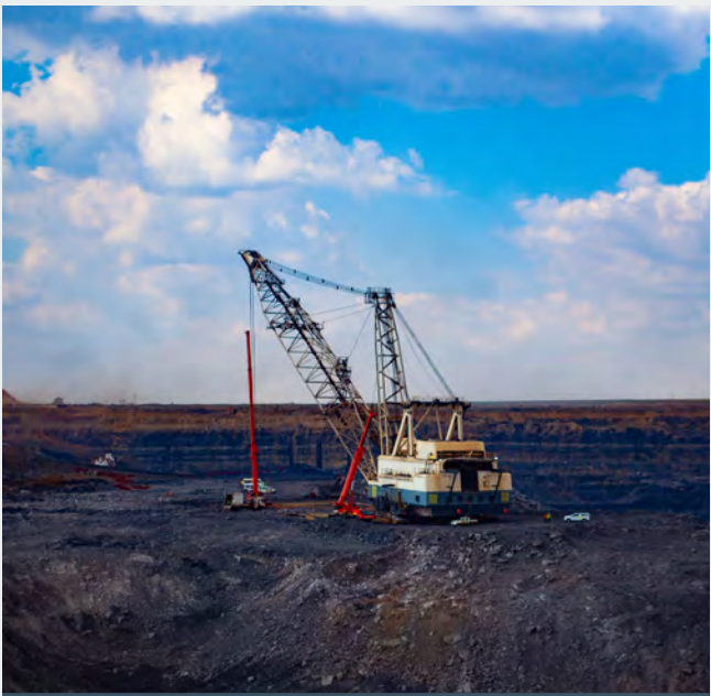
LITHIUM MINE EXPANSION 📍 Western Australia Client: Project Owner Services: Commercial and Contract Advisory