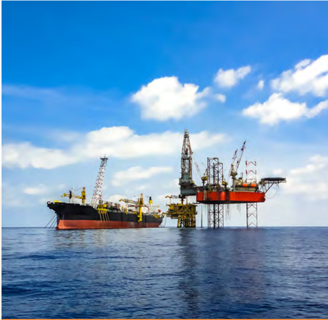
FPSO 📍 Brazil Client: Specialist Contractor Services: Expert Services (Quantum)