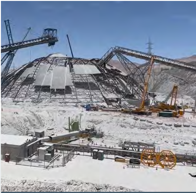
COPPER MINE 📍 Latin America Client: Project Insurer Services: Failure Analysis, Scope Evaluation and Timeline Analysis