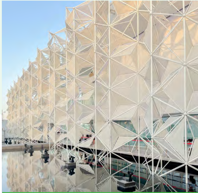
DUBAI EXPO 2020

Client: Main Contractor Services: Construction Claims Advisory (Delay and Quantum)