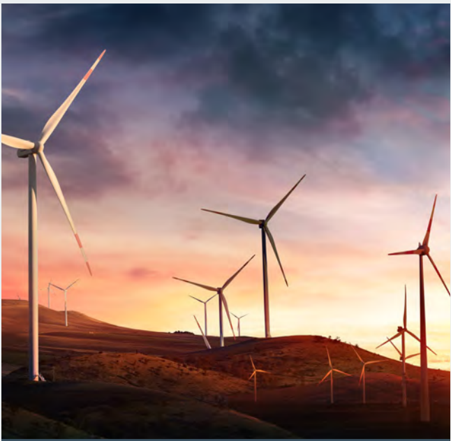
WIND FARM PROJECT

Services: Construction Claims Advisory (Delay and Quantum)