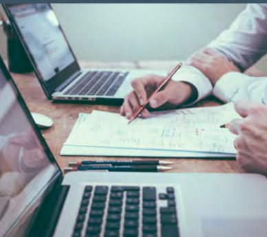
Claims Management and Advisory