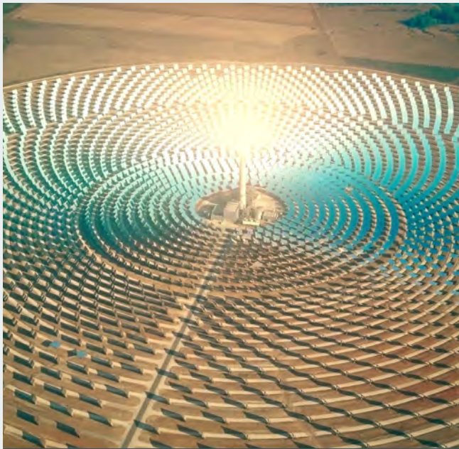
150MW CONCENTRATED SOLAR POWER PLANT