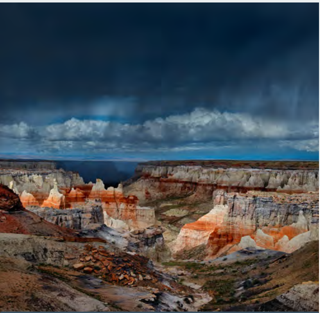
OPEN PIT RARE-EARTH MINE 📍 Nevada Client: Project Insurer Services: Delay Analysis