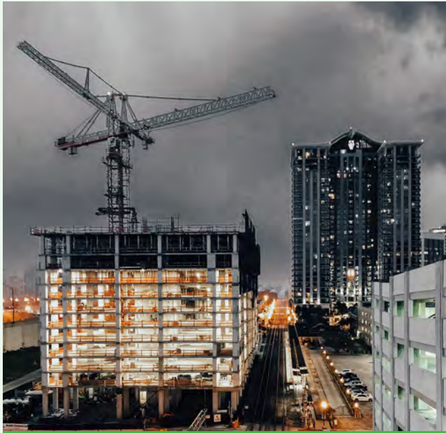
17-ACRE MIXED-USE DEVELOPMENT

Client: Project Insurer Services: Cost Analysis