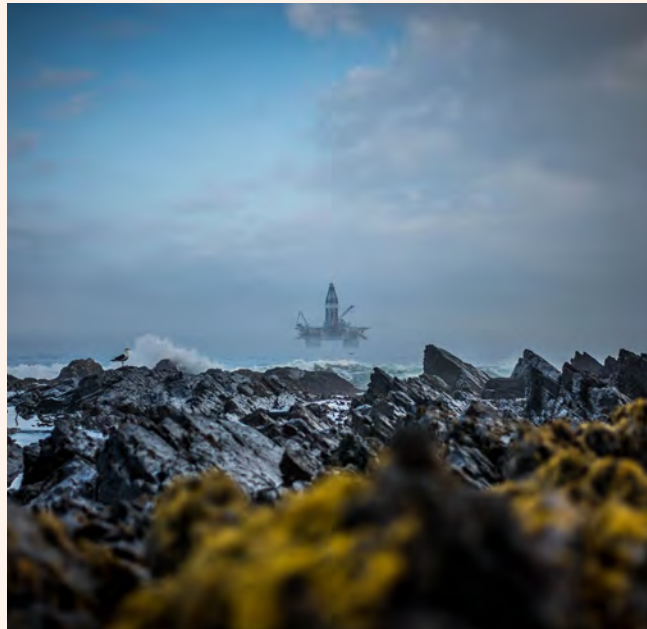
FPSO BROWNFIELD PROJECT 📍 Norway Client: Project Insurer Services: Delay Analysis