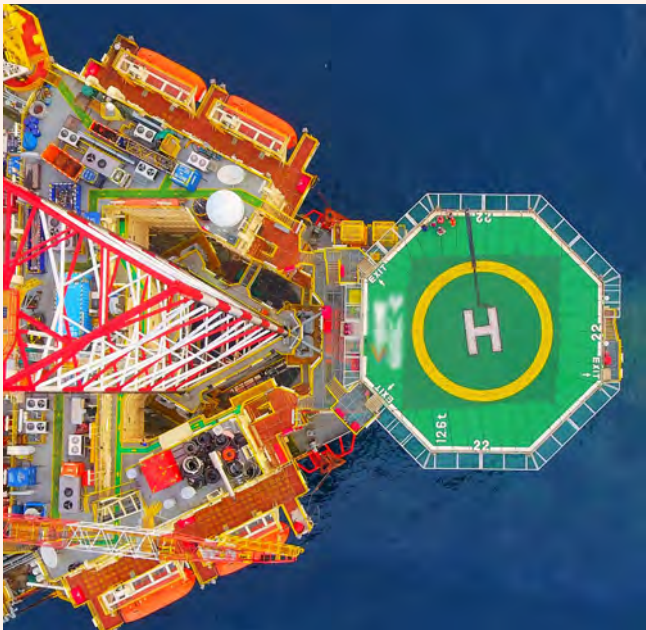
FPSO 📍 Ghana Client: Project Insurer Services: BI Timeline Analysis and Project Monitoring