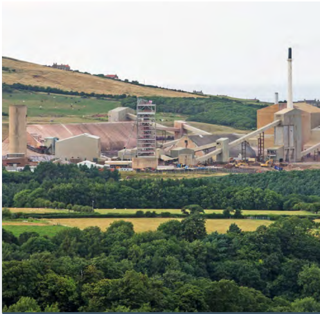
POLYHALITE MINE 📍 United Kingdom Client: Law Firm Services: Expert Witness - Health and Safety