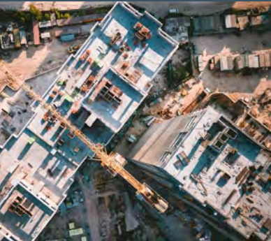
Scope Evaluation / Verification