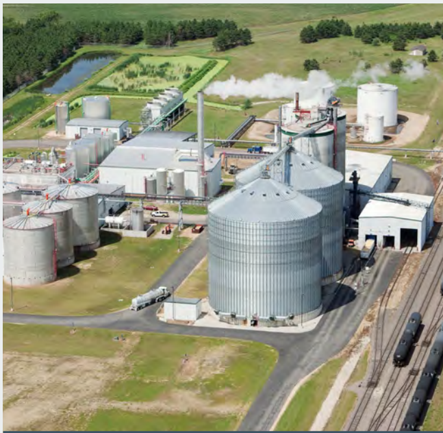
RENEWABLE ENERGY PLANT