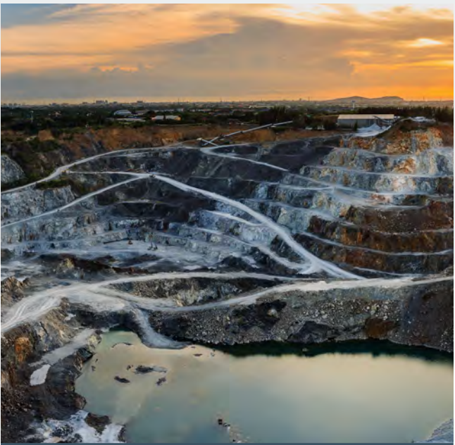
NICKEL MINE 📍 South Pacific Client: Project Insurer Services: BI Timeline Analysis