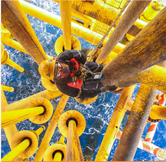
OFFSHORE GAS TURBINE 📍 Vietnam Client: Project Reinsurer Services: Root Cause Analysis