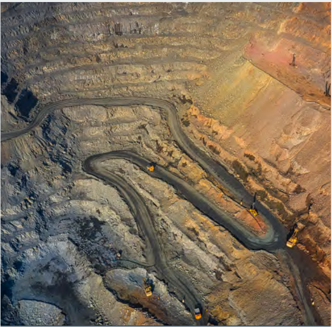
COPPER AND GOLD MINE 📍 South Australia Client: Project Owner Services: Commercial and Contract Advisory and Stakeholder Management