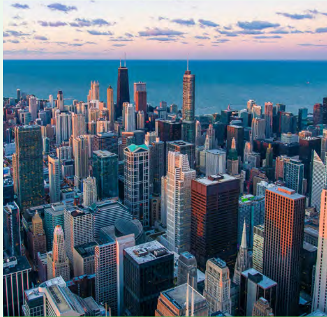
76-STOREY RESIDENTIAL TOWER

Client: Project Insurer Services: DSU Analysis