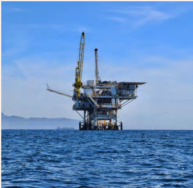
FPSO 📍 North Sea Client: Project Insurer Services: Delay Analysis