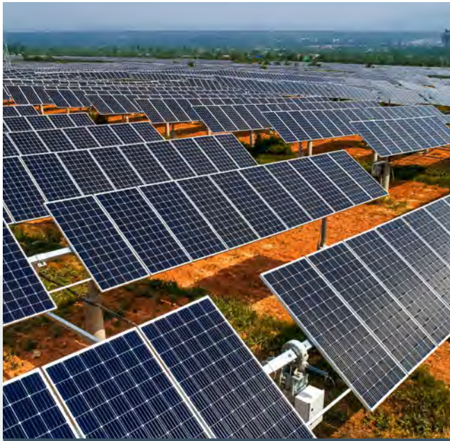
300MW SOLAR PV IPP