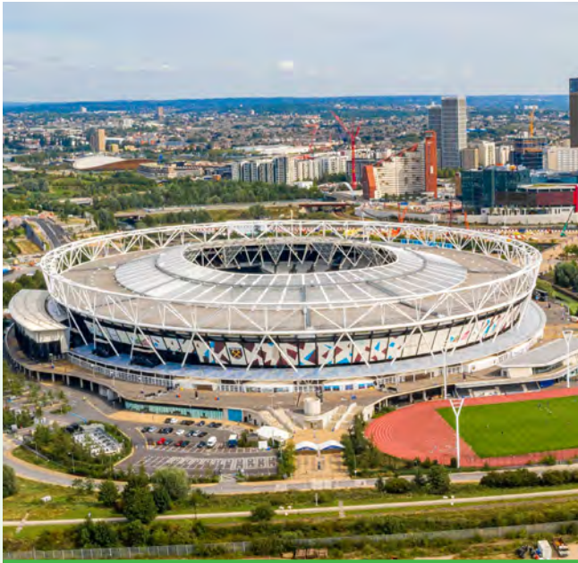
2012 LONDON OLYMPICS