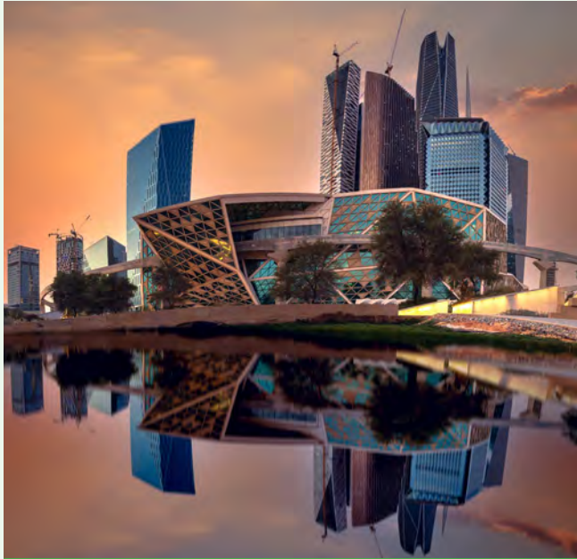
KING ABDULLAH FINANCIAL DISTRICT

Client: Project Insurer Services: DSU Analysis