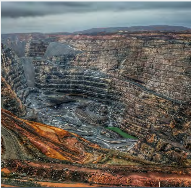
GOLD MINE 📍 Ghana Client: Project Insurer Services: BI Timeline Analysis